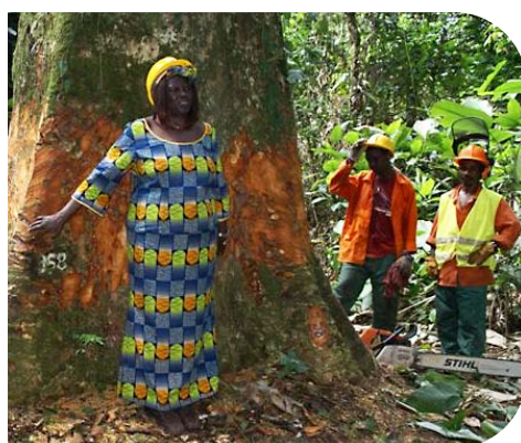
Miss Maathai in the forest of Pokola

W angari Muta Maathai is not a household name in our regions, but in Kenyan political, ecological and academic circles Miss Maathai is a force to be reckoned with. With a degree in biology, she became the first female African university professor and is a distinguished member of the Club of Rome and the Prince Albert of Monaco Foundation. This Nobel Peace Prize laureate has devoted her life to protecting the environment of her beautiful country and continent, by convincing her countrymen that each and every one of them bears responsibility for the biodiversity of their environment. Wangari is the founder of the Green Belt Movement and responsible for planting 30 million trees in Kenya. She is a staunch defender of women's rights